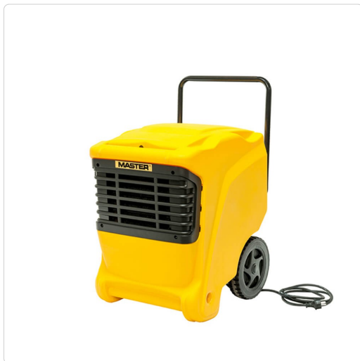
Master DHP 65 – condensation dehumidifier

Highly efficient dehumidifiers designed to for professional rental use. Their robust design makes them perfect for difficult working conditions like the construction industry.