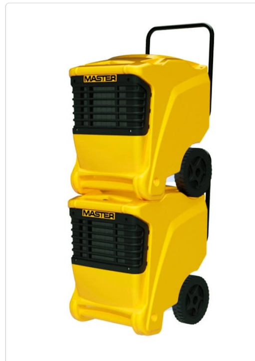
Master DHP 65 stacked