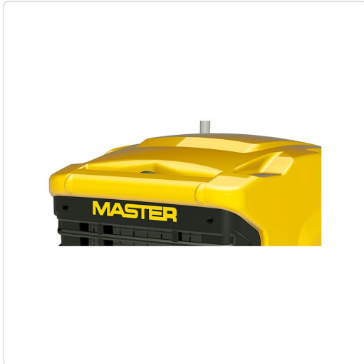
Master DHP 65 top view